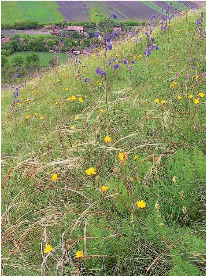
Fig. 4: Long-term abandoned stand of the Stipetum pulcherrimae with Salvia nutans , Leontodon crispus , and Adonis vernalis near Suatu (Photo: Mónika Deák, May 2003).

Abb. 4: Vor langem brach gefallener Bestand des Stipetum pulcherrimae mit Salvia nutans , Leontodon crispus und Adonis vernalis bei Suatu (Foto: Mónika Deák, Mai 2003).