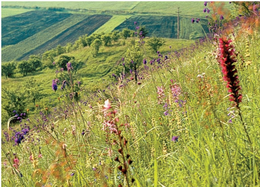
Fig. 3: Species-rich stand of the Stipetum pulcherrimae with Echium russicum , Salvia nutans , Dictamnus albus , Stachys recta , Verbascum phoeniceum , and Campanula sibirica near Mociu (Photo: Eszter Ruprecht, May 2001).