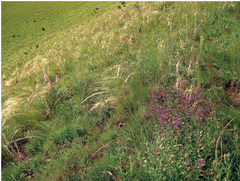
Fig. 2: Extensively grazed stand of the Stipetum lessingianae with Nepeta ucranica near Valea Florilor (Photo: András Kun, May 2003).