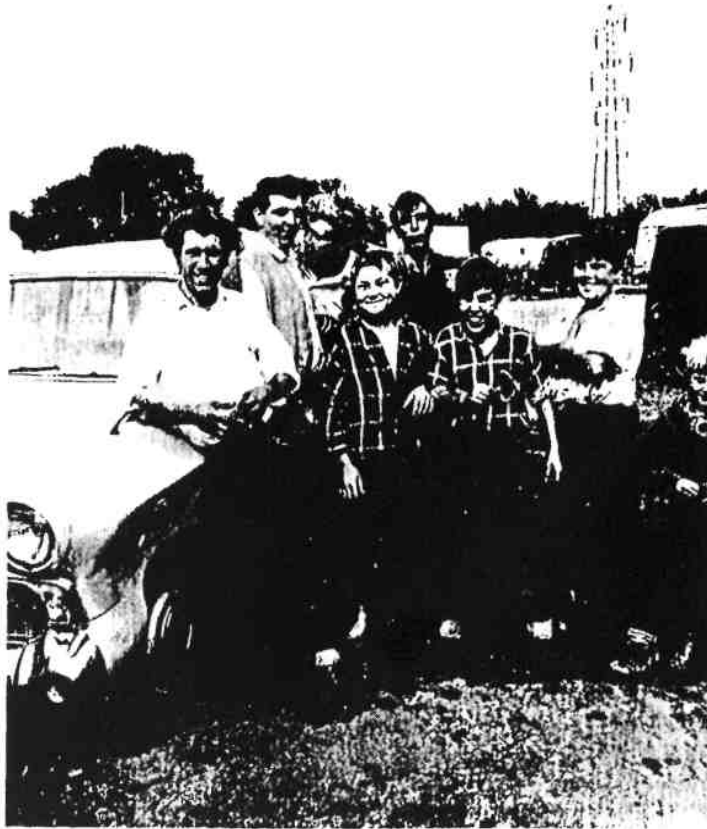
English Gypsy men and boys.

This survey set the tone for other local authorities. The fiction of the 'full-blooded' Romany was used to condemn the majority, if not all of the Gypsies in the locality, and even to justify making no site provision when the 1968 ruling required it (see Okely 1975a:33). In practice of course it has been impossible to identify 'Romanies' by their physical or 'racial' features. The physiognomy of the majority of Gypsies is very