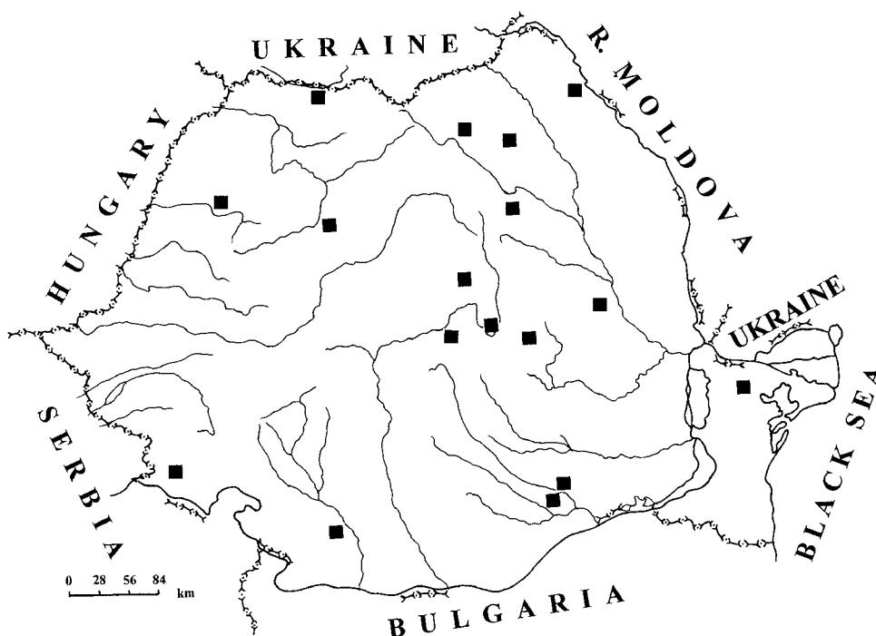
Fig. 1 – Distribution of the Parti-colored Bat ( Vespertilio murinus L., 1758) in Romania.