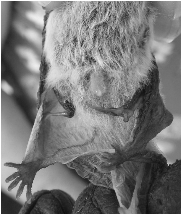
Fig. 1 - Shape of the penis of an adult male of Pipistrellus kuhlii captured in Constanța.

Seven examples were collected and brought to the laboratory; two of them were regarded as adults and five as juveniles. Species identification was made on an adult male (Fig. 1) found among females and juveniles in the colony, using the characters given by Dietz and von Helversen (2004).