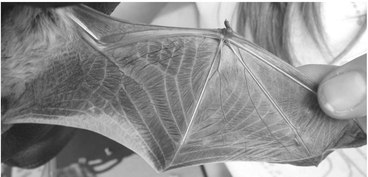
Fig. 2 - White edge of the wing – a typical character of Pipistrellus kuhlii.

Diagnostic characters: dorsal pelage with bicolored hairs – dark-brown at the base with yellowish-brown tips. Ventral side lighter, but not strongly contrasting with the back. Ears and nose light-brown. Posterior margin of the ear with a sharp indentation. A well defined white stripe (Fig. 2) present along the margin of the dactylopatagium, plagiopatagium, and uropatagium. The white stripe wider between the fifth finger and the hind foot, measuring up to 5 mm. Penis spear-shaped. First upper incisor monocuspid. Outer upper incisor very small and not visible when viewed from sideways. The small second premolar ( P^3 ) not visible from the outside, being displaced on the median line of the toothrow (Fig. 3).